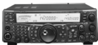
TS-2000 HF/VHF/UHF TCVR