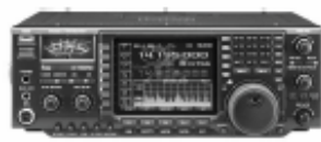
IC-756 PRO III All mode Transceiver