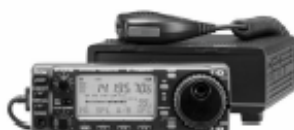
IC-706MKIIG HF/VHF Transceiver