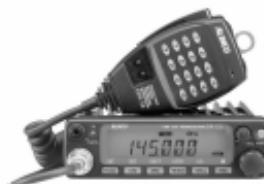
DR-135TP 2M mobile