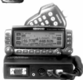
TM-D700A 2M/440 Dualband